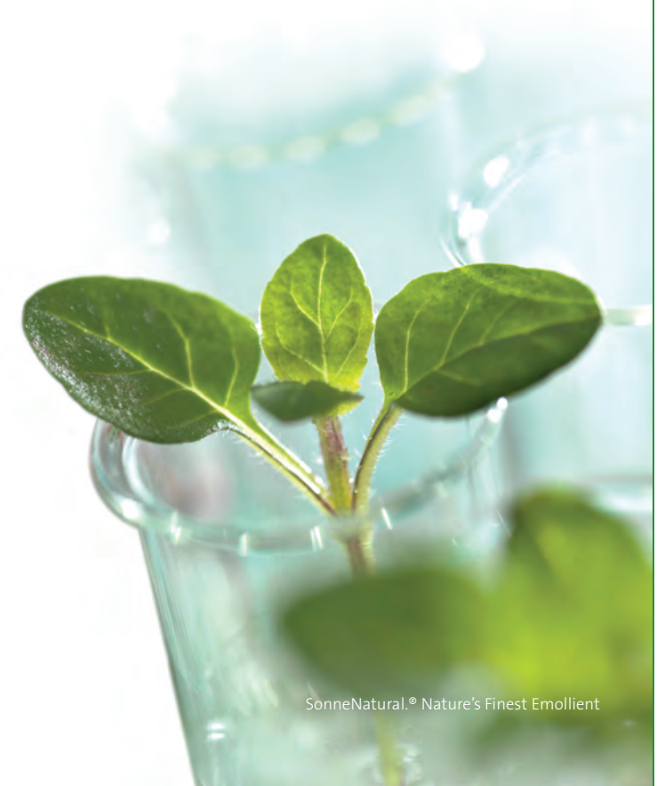
SonneNatural.® Nature's Finest Emollient

SonneNatural®, SonneNatural® 200 Series, and SonneNatural® Select brand of products. Nature's Finest Emollients.