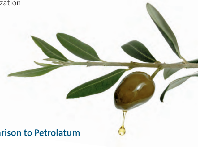
SonneNatural® TEWL Comparison to Petrolatum

MOISTURE RETENTION AND EMOLLIENCY. Ideal skin care formulas typically contain an ingredient that improves barrier function while helping to supplement the natural epidermal lipids. Keeping the skin supple and pliable are very important features for creams and lotions. Since petrolatum has long been the benchmark for preventing moisture loss through the skin, Sonneborn has focused on developing products with similar skin protection. Transepidermal Water Loss (TEWL) data is available showing that SonneNatural exhibits improved skin moisturization.